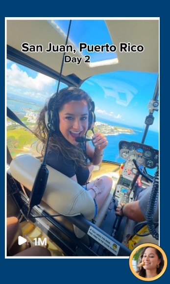
How to Spend A Day Outdoors in Puerto Rico